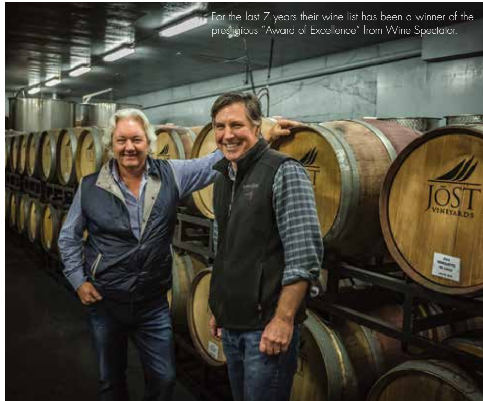
For the last 7 years their wine list has been a winner of the prestigious "Award of Excellence" from Wine Spectator.