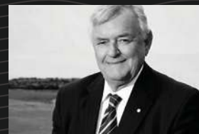
Chairman & Owner, Fox Harb'r Resort Co-founder, Tim Hortons

1337 Fox Harbour Rd Wallace, Nova Scotia 1.866.257.1801 | foxharbr.com